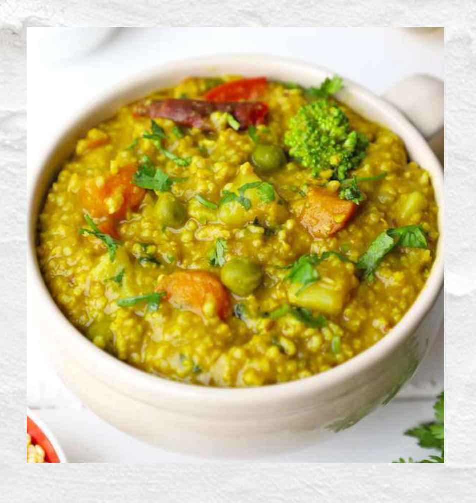
Multi Millet Khichdi