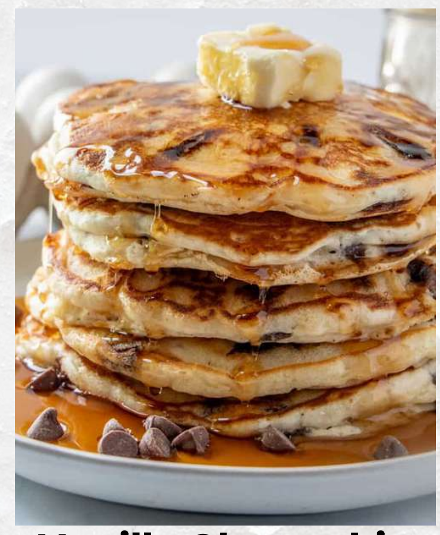
Vanilla Choco chip Pancake(Gluten Free )