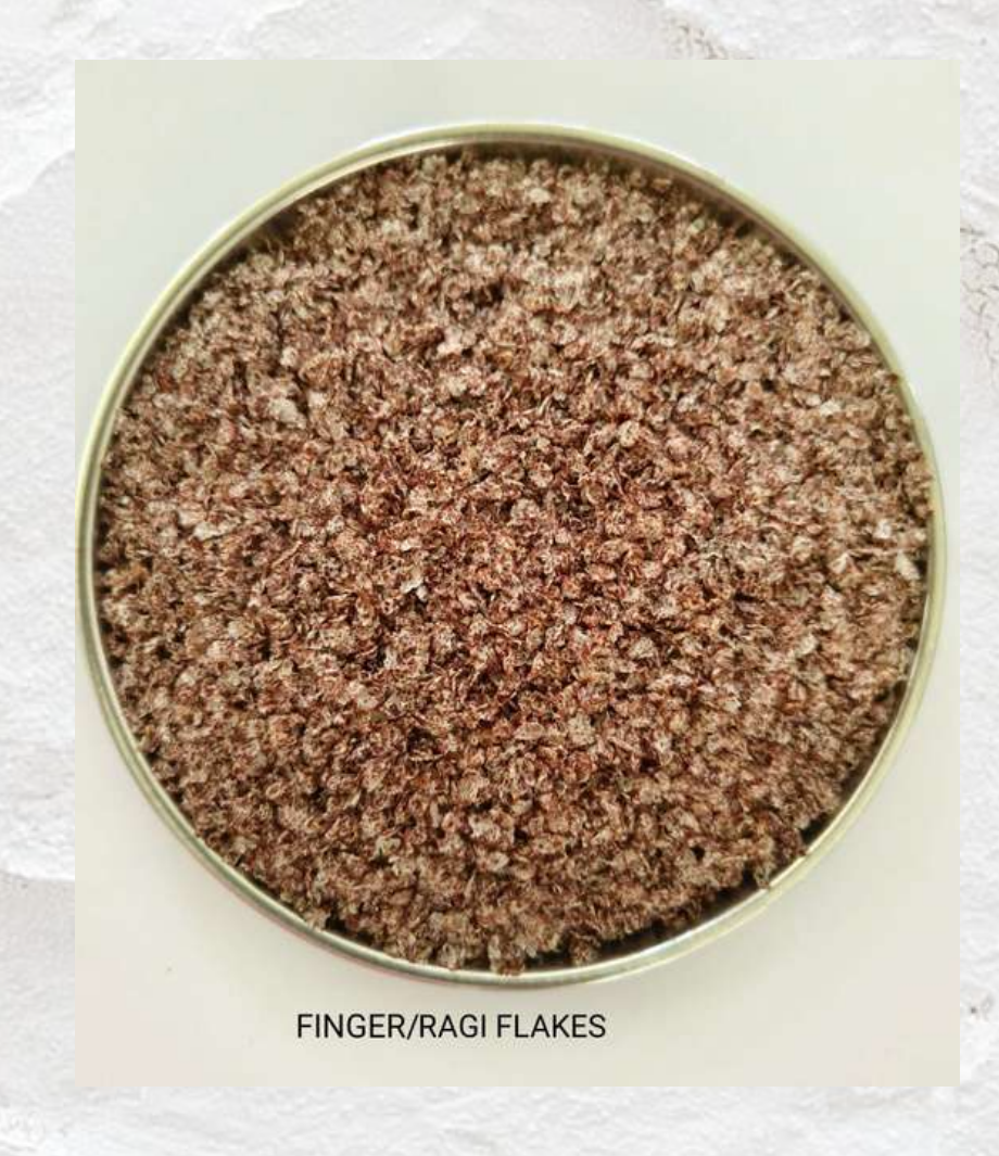
Finger Millet Flakes