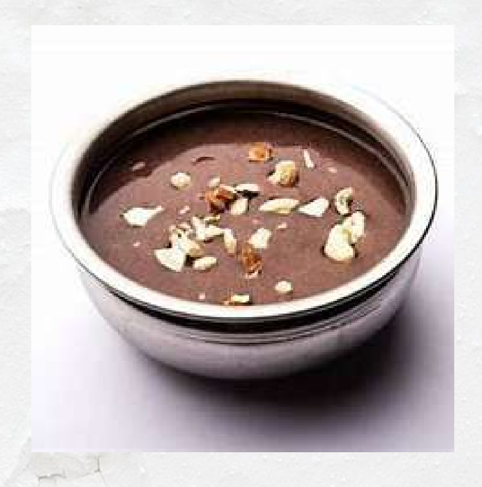
Finger Millet Ragi Malt