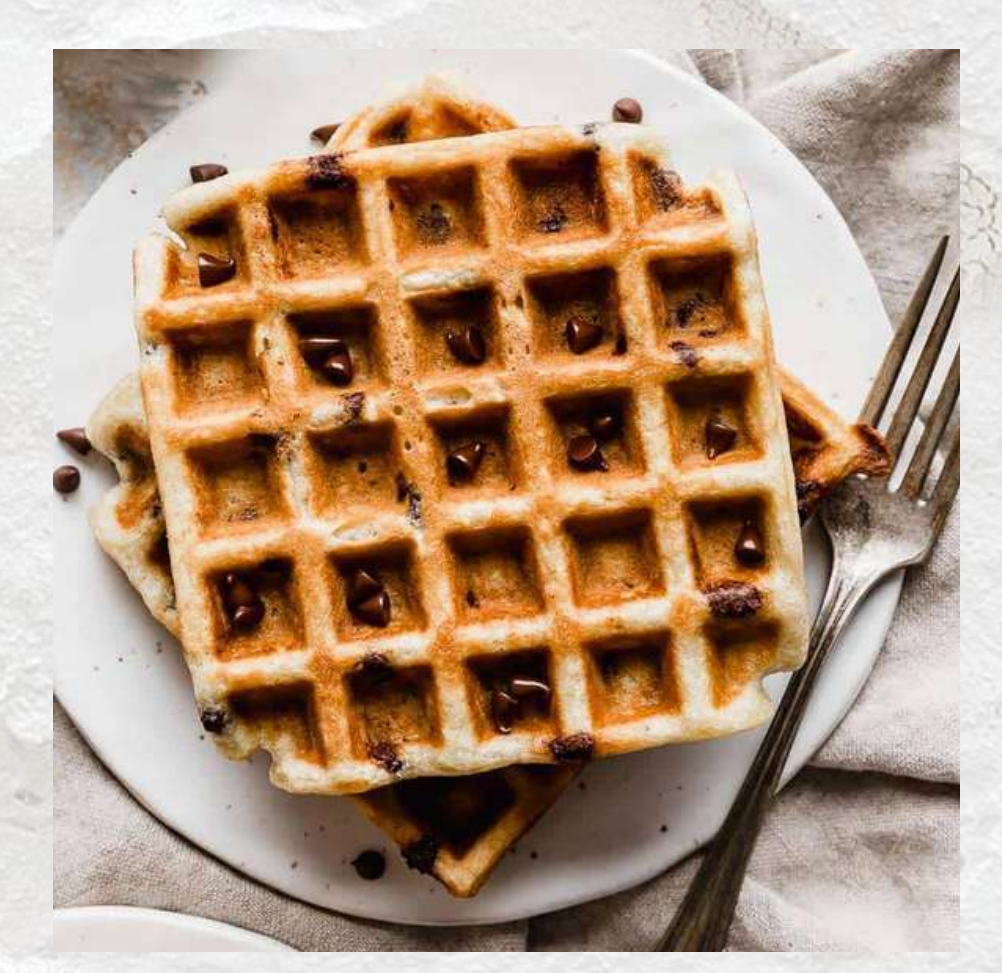
Plain Vanilla Waffle Mix-Gluten Free