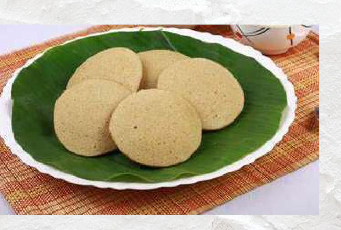
Jowar Oats Idli