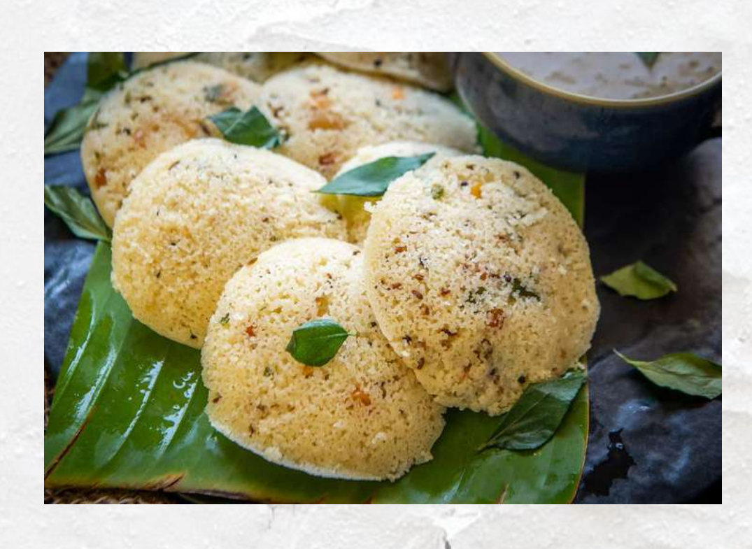
Multi Millet Idli