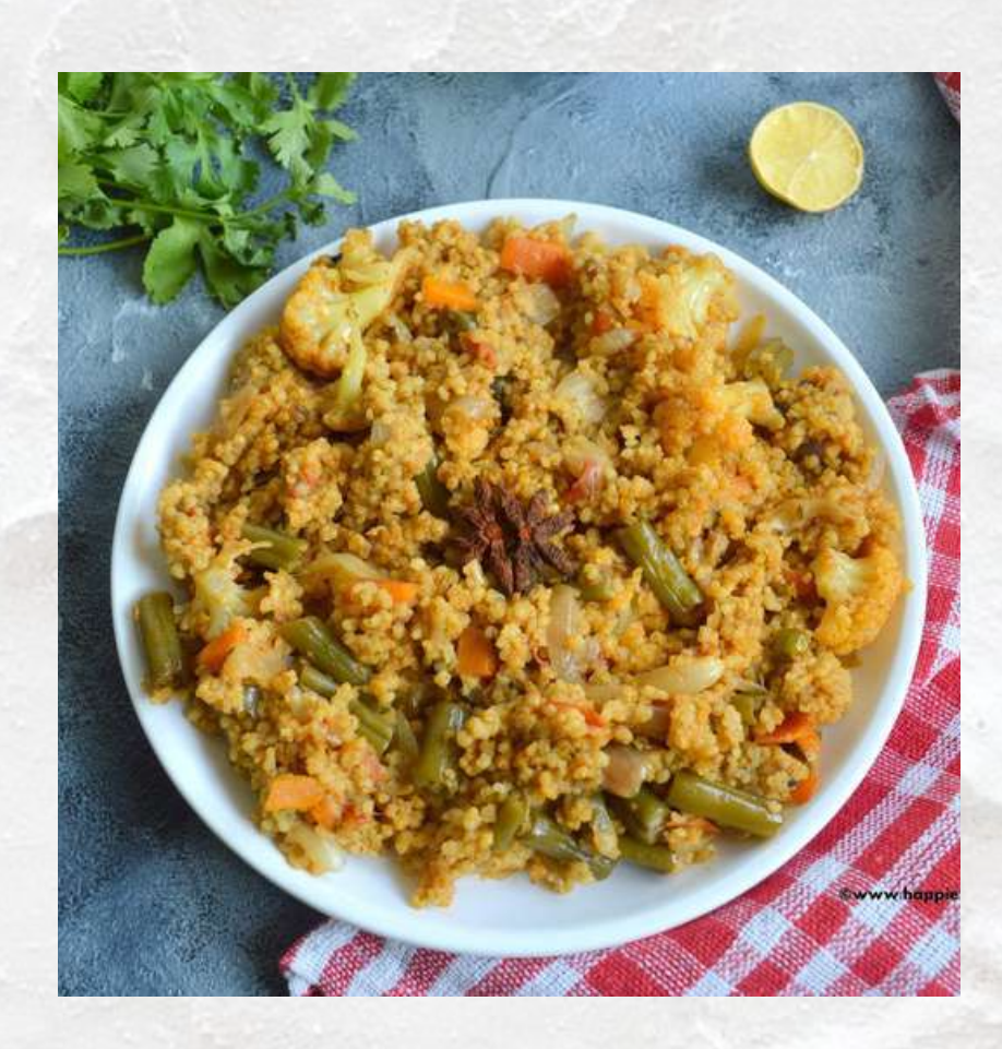
kodo Millet Biryani