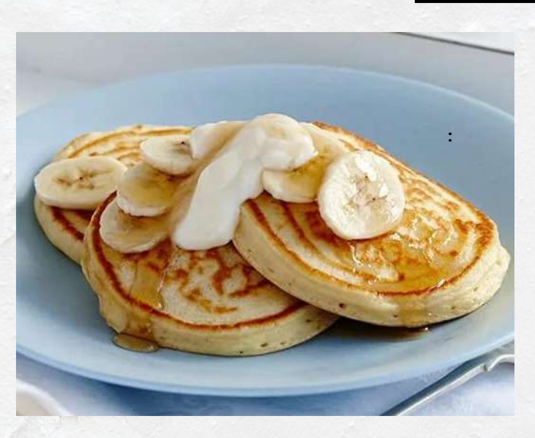
Vanilla Pancake (Gluten Free)