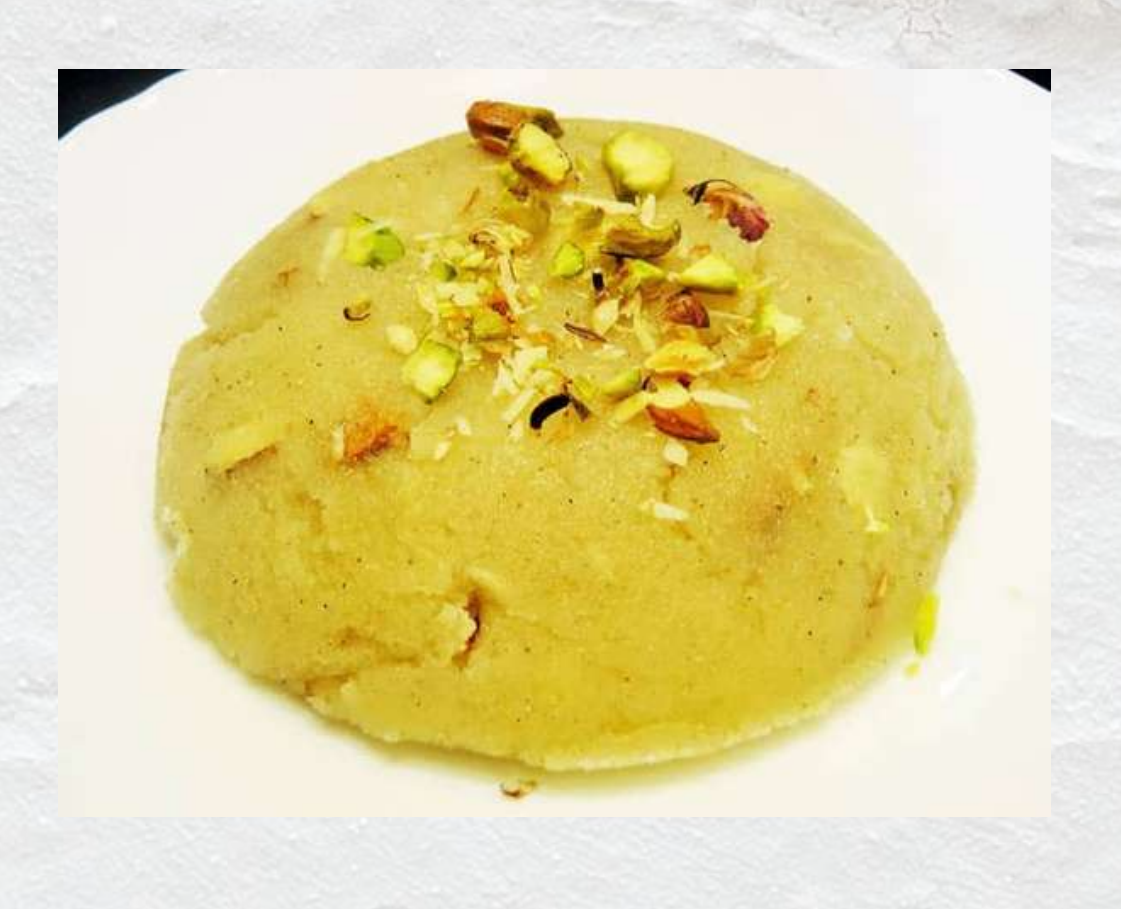
Multi Millet sheera