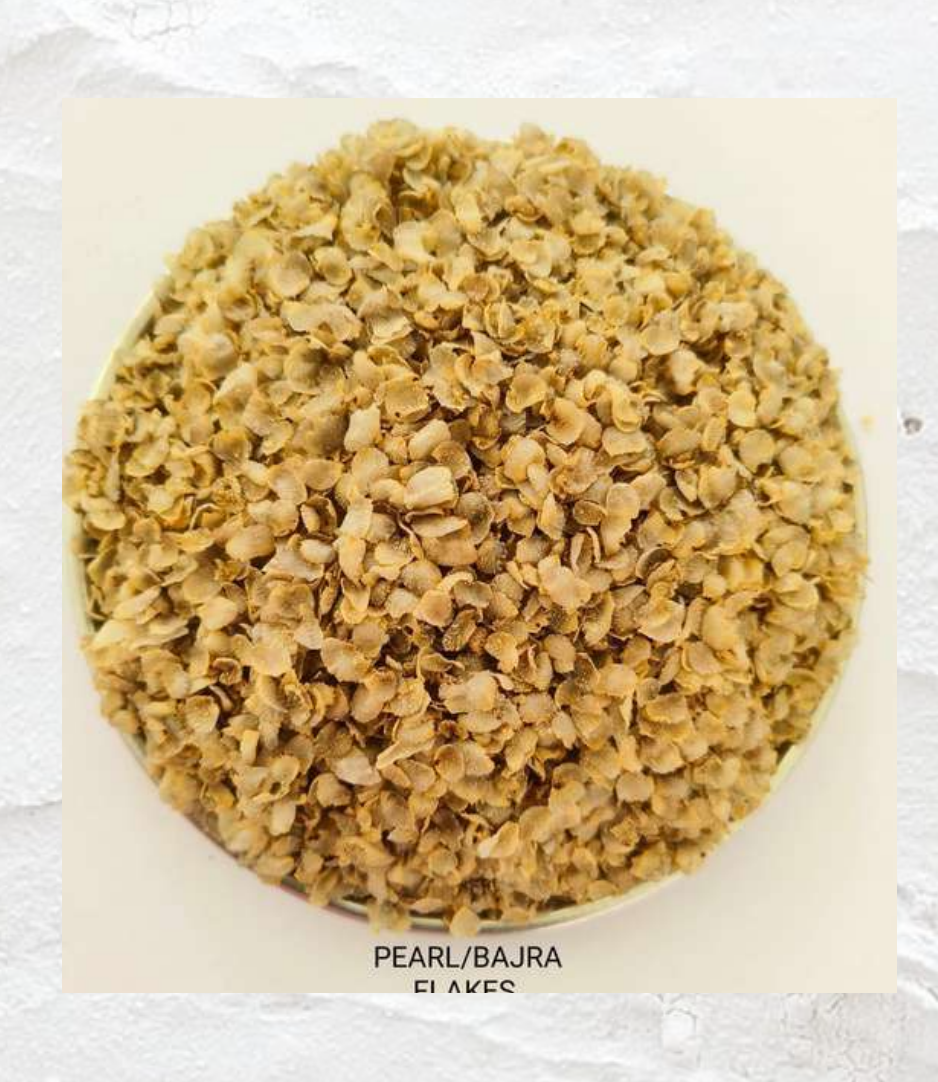
Pearl Millet Flakes