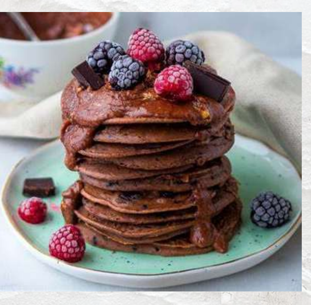
Double Choclate Chocochip Pancake-Gluten free