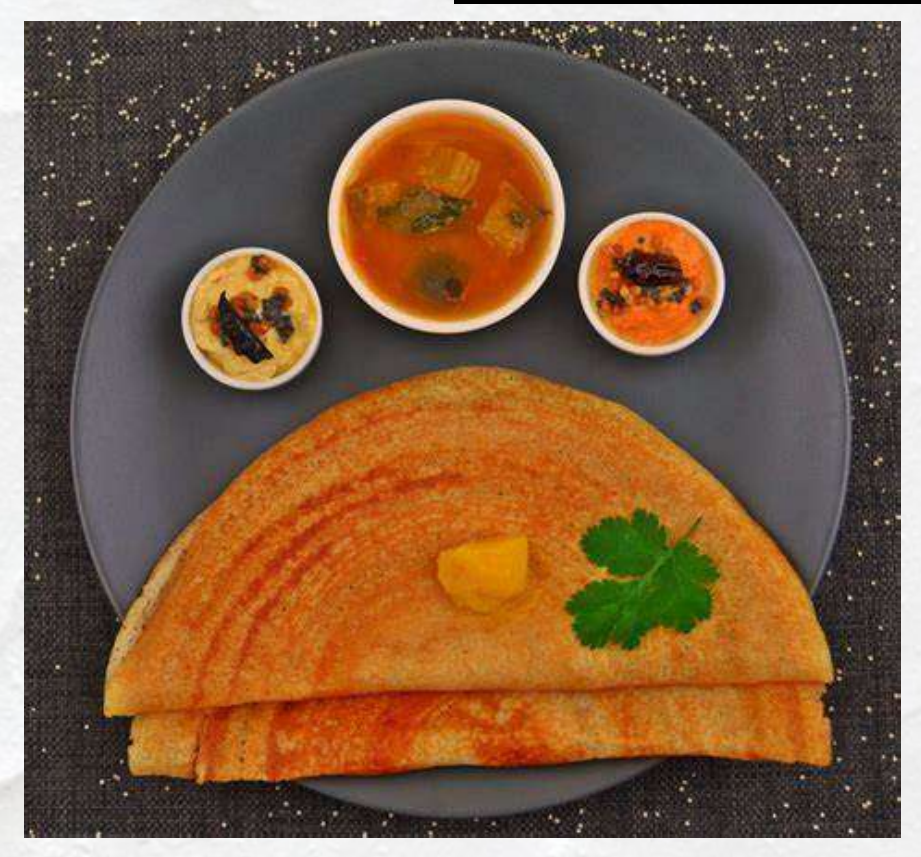
Multi Millet Dosa