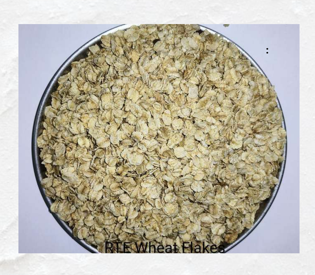
RTE Wheat Flakes