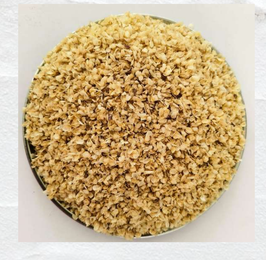
Foxtail Millet Flakes