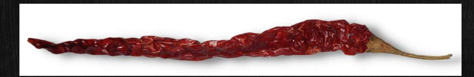
355 Chili/ 655 chili