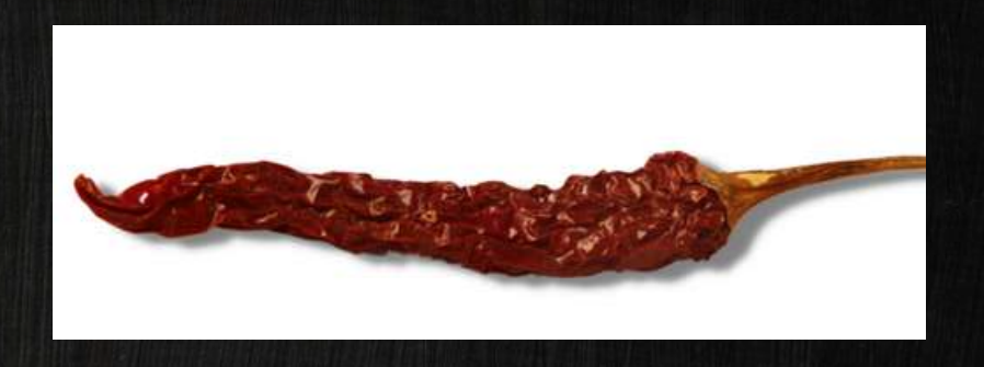
Indo -5 Byadagi Kaddi