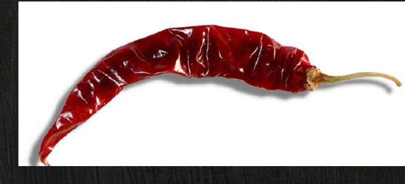
Devanur Delxue Donga Byadgi