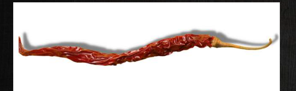
Sygenta 5531 Byadagi