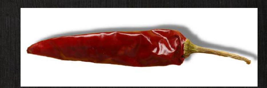
Indo -5 Guntur