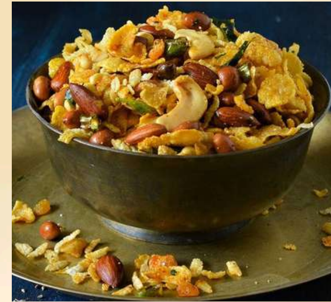
DRY FRUITS MIXTURE