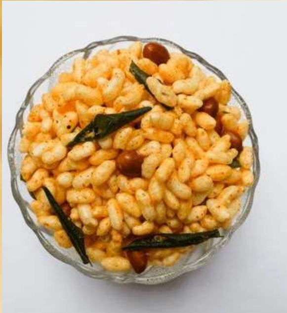
MASALA PUFFED RICE