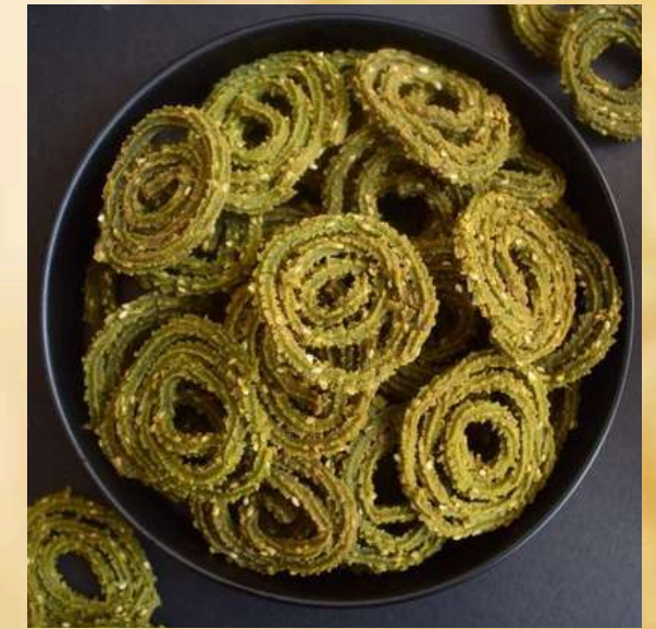
CURRY LEAVES MURUKKU