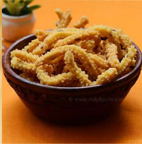
MILLET BUTTER MURUKKU